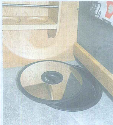
A bin inset into the worktop for food waste is one of the small but useful features.