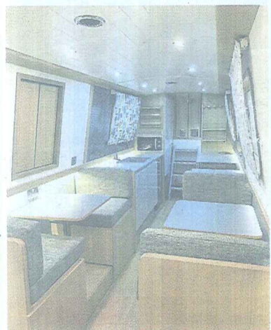
Galley and dinette.

Boat builder: Ortomarine. Unit 4A Cursley Distribution Park, Curslow Lane, Shenstone, Worcestershire DY10 4DX Tel: 01299 489424 Website: www.ortomarine.co.uk Email: info@ortomarine.co.uk