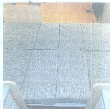
Dinette bed configurations.

The modern styling may not be to everyone's taste, especially if you err towards the more traditional, but if you like a clean and uncluttered look, then Happy Wanderer is for you.