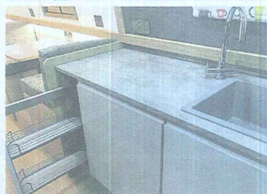
Loads of storage.

space on offer, with a large amount of storage available below these dinette seats, with one being used as the location for the freezer. In one configuration, the seating moves away from the living space, thus increasing this area still further. Another instance of the boat's design making the most of the space available. Undoubtedly this dining area will be left in the most useful configuration for the users, but it's good to have the flexibility to adapt the space to suit your needs should they change.