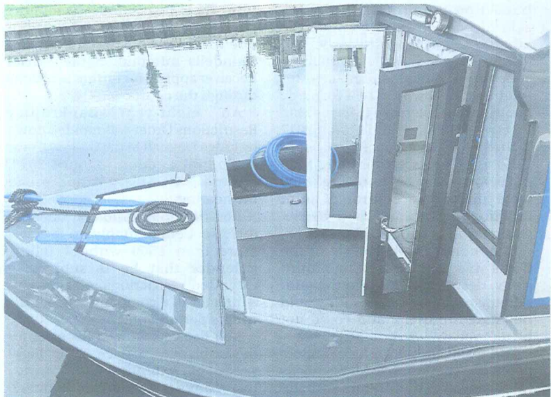
Well deck.

Phil Pickin visits a highly adaptable, stylish narrowboat, intelligently built to accommodate small or larger numbers